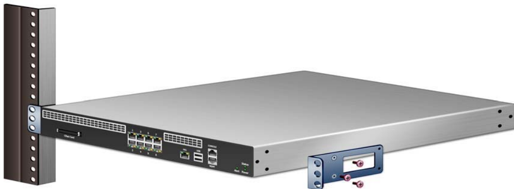
Figure 1-2 Front mounting a 1U chassis in a two-post rack