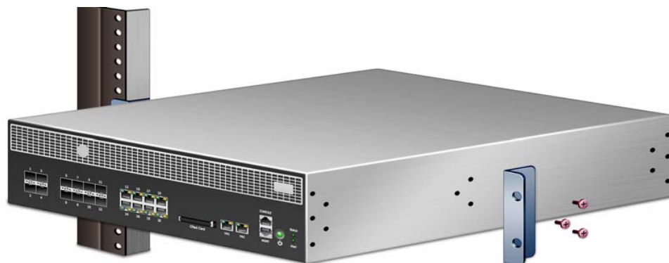
Figure 1-7 2U chassis with mid-mounting in a two-post rack