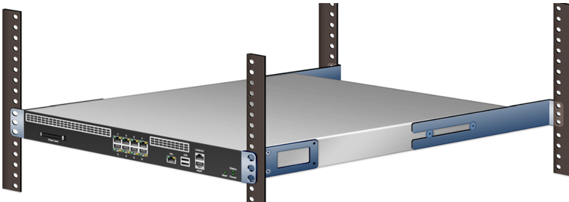
Figure 1-4 1U chassis in a four-post rack