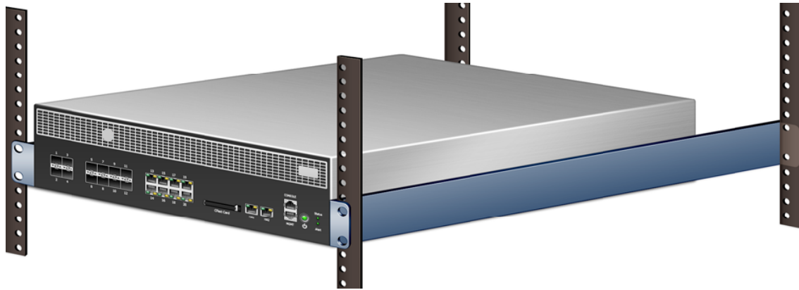
Figure 1-8 2U chassis in a four-post rack

Use Figure 1-8 as a reference for how a 2U chassis is installed in a four-post rack with slide rails.