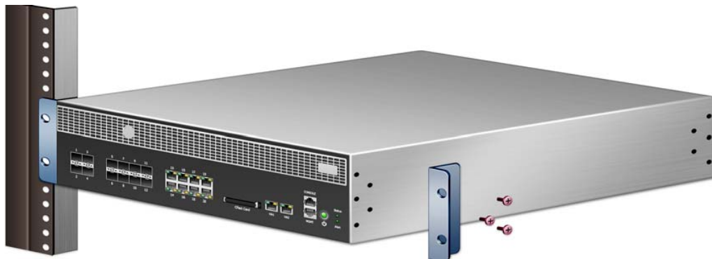
Figure 1-6 2U chassis with front mounting in a two-post rack

Use Figure 1-6 as a guide for how the front rack-mounting brackets are attached to the appliance and to the rack in a front mount. Use Figure 1-7 as a guide for how the front rack-mounting brackets are attached to the appliance and to the rack in a mid-mount.