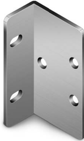
Figure 1-5 2U chassis front-mount bracket and ear