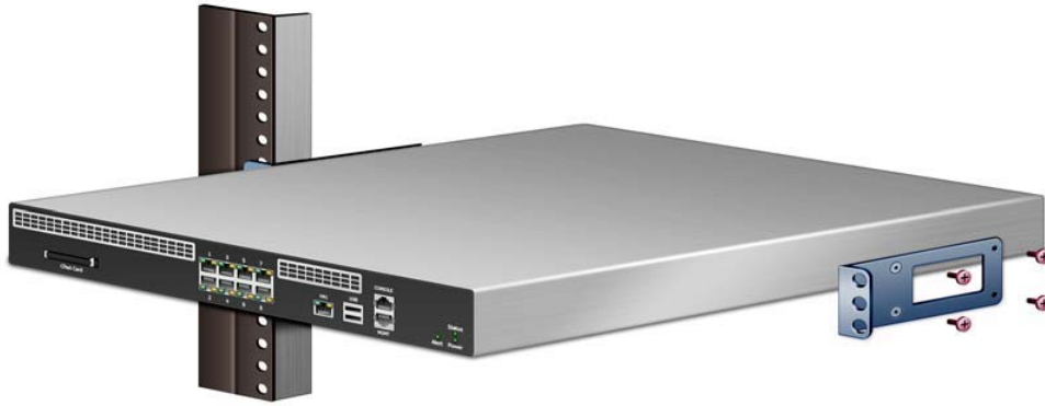
Figure 1-3 Mid-mounting a 1U chassis in a two-post rack